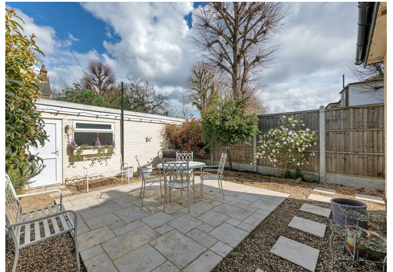
Garage 20'9" x 8'6"